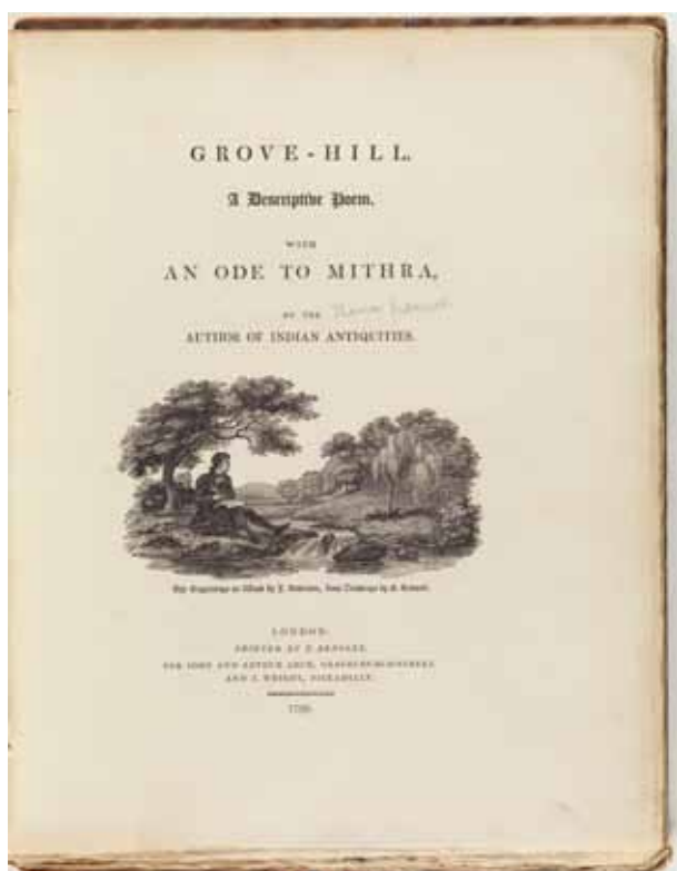
Title page of Grove Hill, with a Descriptive Poem Ode to Mithra , (30cm) 4to.