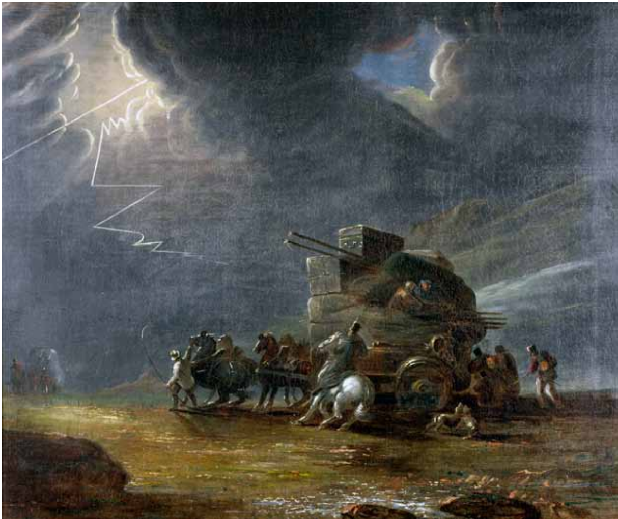
Luke Clennell, The Baggage Wagon , 1812, oil on canvas, Laing Art Gallery, Newcastle upon Tyne (Tyne & Wear Archives & Museums)

experimenting in oil painting, producing work such as The Baggage Wagon . (Illustrated)