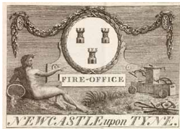
Policy heading for the Newcastle upon Tyne Fire Office, engraved on copper by Thomas Bewick, 15 February 1783 at a charge of £3 3s. 0d. 105x142mm. Private Collection.

The British Museum Press, May 2014 144 pages, 100 engravings ISBN 978 0 7141 2691 3 Paperback £9.99