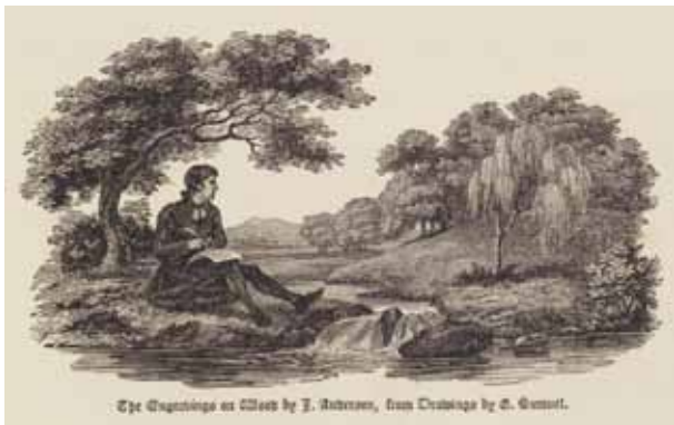
Detail Title page of Grove Hill, with a Descriptive Poem Ode to Mithra

Aged twenty-four he was now on the threshold of a successful career as one of the leading wood-engravers in Brit-