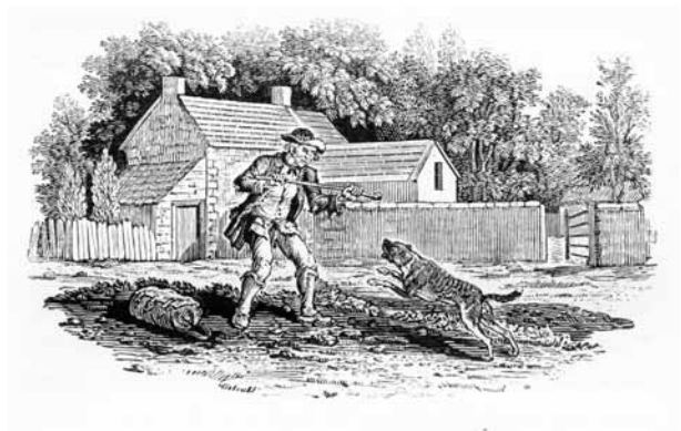
A man has dropped his pack to the ground and holds his walking stick in both hands to fend off a dog. A History of British Birds, Water Birds (1804) p.84