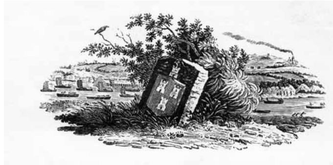
'The Newcastle Arms on a Boundary Stone,' engraving for the title page of A History of British Birds: Land Birds (1797).

Castellano, K., 2013. The Ecology of British Romantic Conservatism, 1790-1837 . Palgrave Macmillan, Houndmills, Basingstoke, Hampshire; New York. Part Two, Habitation, Chapter Three: "Thomas Bewick's A History of British Birds and the Politics of the Miniature" pp. 65-90.